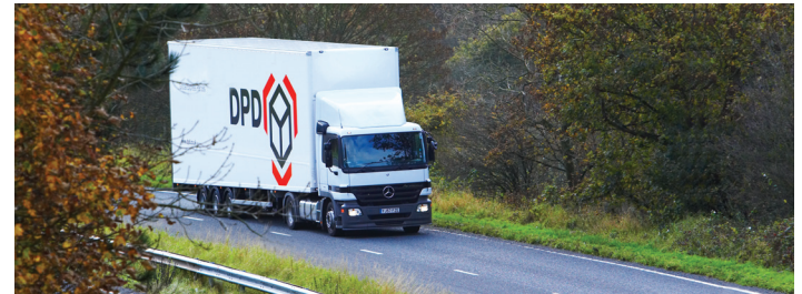
DPD will be introducing new services throughout the year. Call 0500 005 005 for more details.

DPD offers one of the fastest, most reliable delivery services in Europe. With approximately 800 depots spread throughout Europe and beyond, the network handles up to 2 million parcels every day. To satisfy the existing 200,000 DPD customers still further, leading-edge barcode technology, with full international tracking facilities, is available via the Interlink Express website.